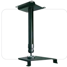
PSS-610NL Ceiling Bracket