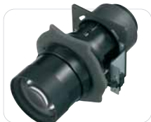
VPLL-Z1032 Zoom Lens (3.24 – 4.95:1)