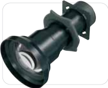
VPLL-1008 *** Fixed Lens (0.78:1)