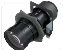
VPLL-Z1024 Zoom Lens (2.38 – 3.26:1)