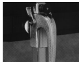
SCREEN FABRIC TENSION LEVER Locking the screen fabric rigidly in place during usage, the screen fabric tension lever prevents the surface from shifting, ensuring long product life.