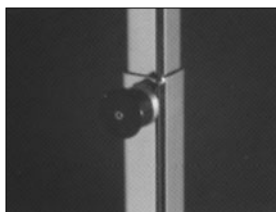
SELF-LOCKING EXTENSION TUBE An easy operating height adjuster and a screen case lock.