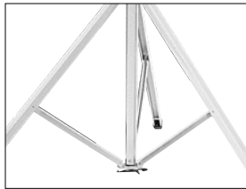
EXTRUDED ALUMINUM LEGS WITH TOE RELEASE Heavy-gauge tripod legs lock securely for transport and release at the touch of a toe.