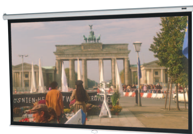
Matte White, High Contrast Matte White and Video Spectra 1.5 fabrics are seamless in all sizes. High Power® fabric will be seamless up to 6' high.