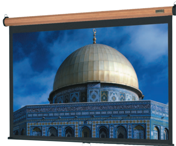
All fabrics will be seamless.