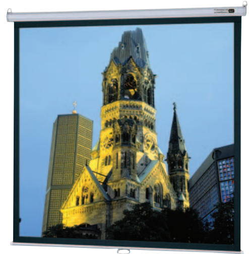
Matte White, High Contrast Matte White and Video Spectra 1.5 fabrics are seamless in all sizes. High Power® fabric will be seamless up to 6' high.