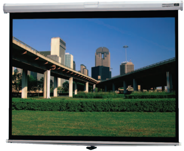
All fabrics will be seamless.