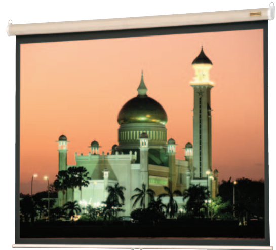
All fabrics will be seamless.