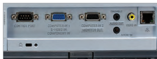
Just connect, and project.