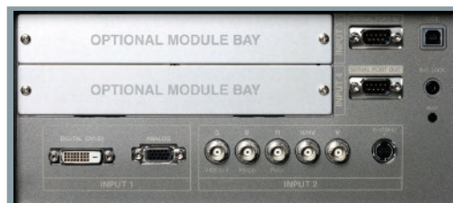
Ready to connect and project. Add Network, SDI, more!