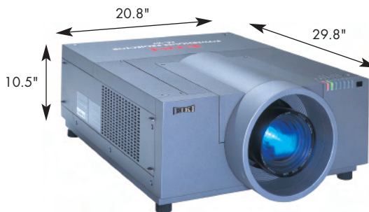
LC-X8 - XGA Powerhouse Projector.