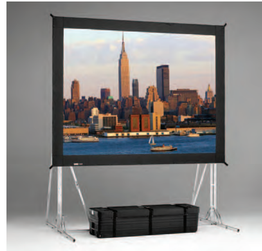
Masking panels available. See page 116.