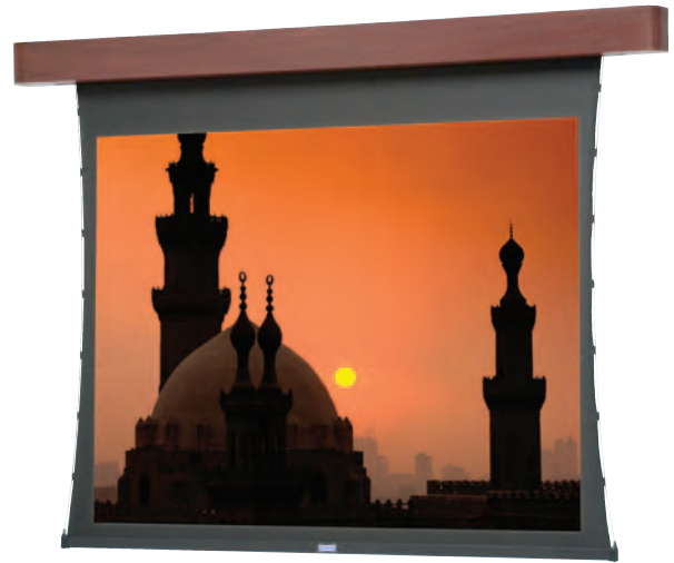
All fabrics will be seamless.