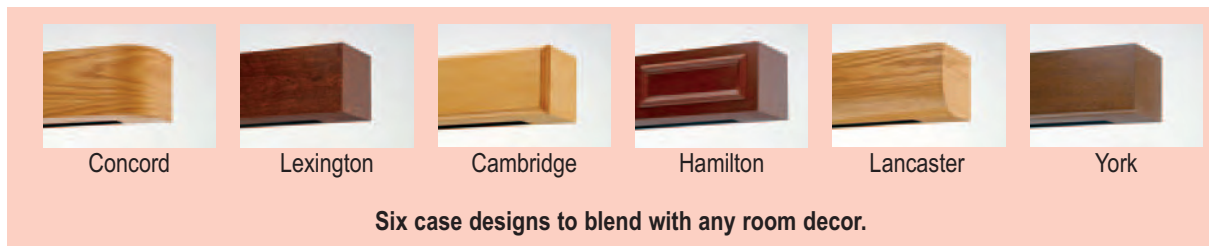
Six case designs to blend with any room decor.