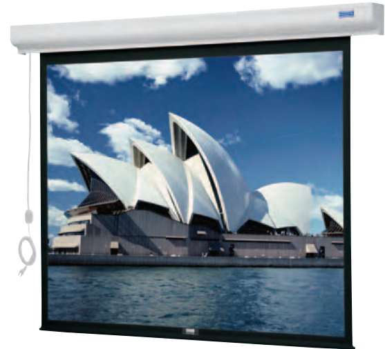
Matte White, High Contrast Matte White and Video Spectra 1.5 fabrics will be seamless in all standard sizes. High Power® fabric up to 6' high will be seamless.