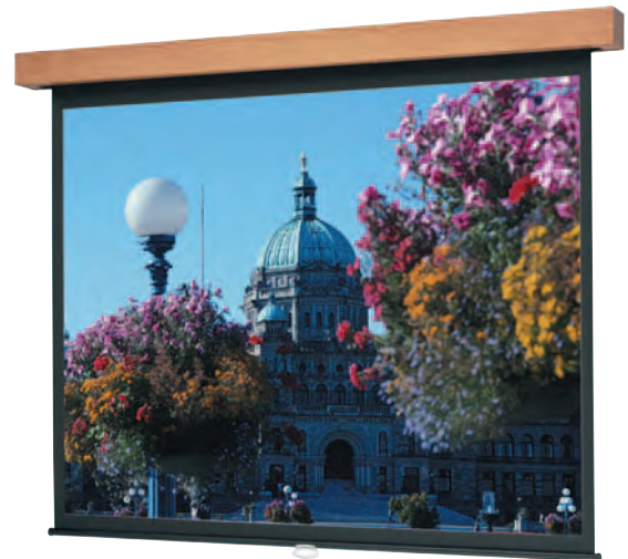
All fabrics will be seamless.