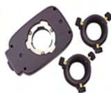
Microscope Adapter & Coupler