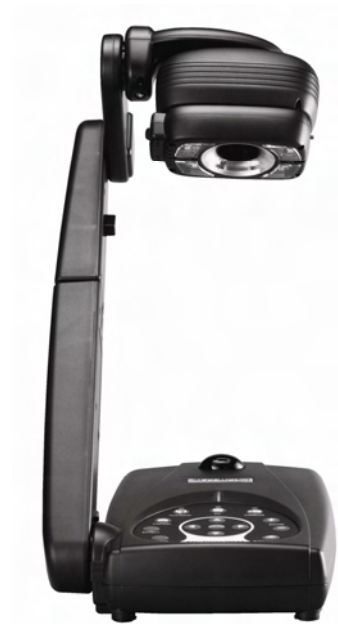
Adjustable Camera Rotation