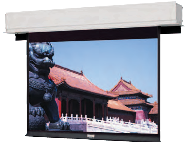
Matte White fabric up to 10' high will be seamless. High Contrast Matte White and Video Spectra 1.5 fabrics up to 8' high will be seamless. High Power® fabric up to 6' high will be seamless.