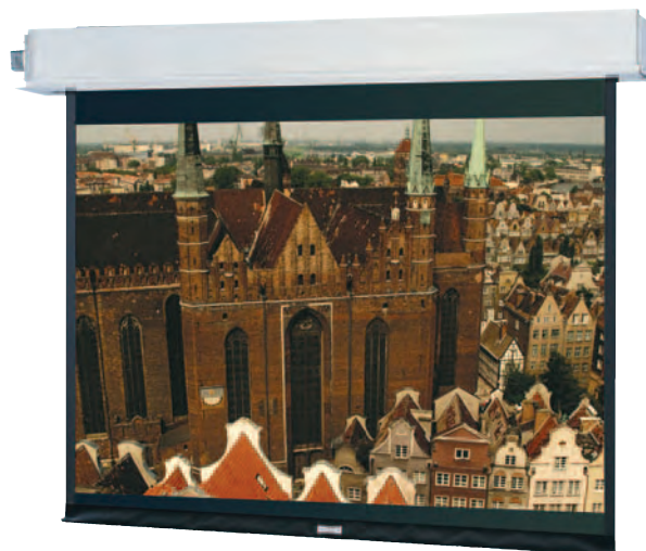
Matte White fabric up to 10' high will be seamless. High Contrast Matte White and Video Spectra 1.5 fabrics up to 8' high will be seamless. High Power® fabric up to 6' high will be seamless.