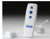
For optional remote control operation, see options on pages 50-54.