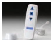
For optional remote control operation, see options on pages 50-54.