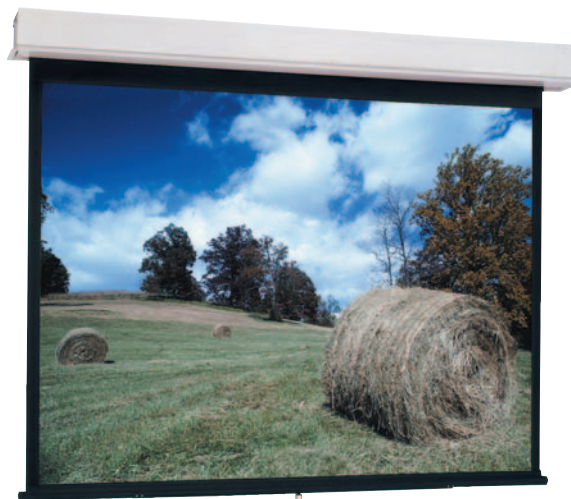
Matte White fabric up to 10' high will be seamless. High Contrast Matte White and Video Spectra 1.5 fabrics up to 8' high will be seamless. High Power® fabric up to 6' high will be seamless.