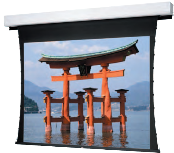
All fabrics will be seamless.