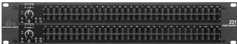
231- Dual Channel 31 Band Graphic EQ

Input Gain Control: This control sets the signal level to the equalizer. It is capable of -12dB to +12dB of gain. Its effect is apparent by viewing the OUTPUT LEVEL BAR GRAPH.