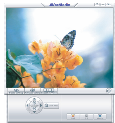
Image capture and USB camera capabilities