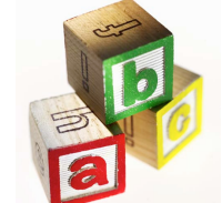
3.2 Mega Pixel